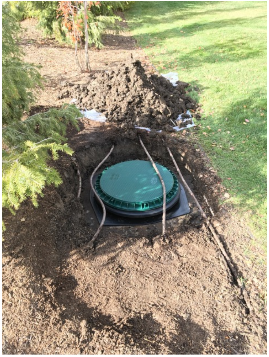
Landscape irrigation hoses lay over the lid