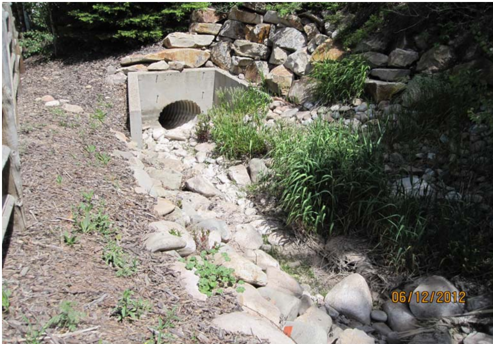
Photo 5 — 2012 Parcel V from Silver Springs Drive to the little lake/pond, was originally a fish ladder. New gate height built last summer hampers the flow of water from lake to Parcel V and down to Parcel Q .