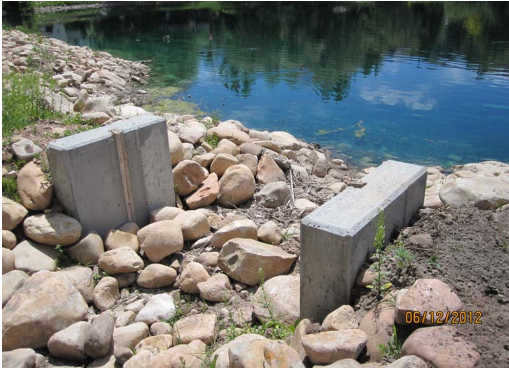
Photo 6 — Small lake gate built too high to allow water to flow from little pond to Parcel V fish ladder, to the Creek Easement, to Lot 173 pond, to Parcel Q then into the large lake. Entire water path has dried up. 2011 gate: http://www.silverspringscommunity.com/wp-content/uploads/upperpond-gate-eastside2008-01a530px.jpg