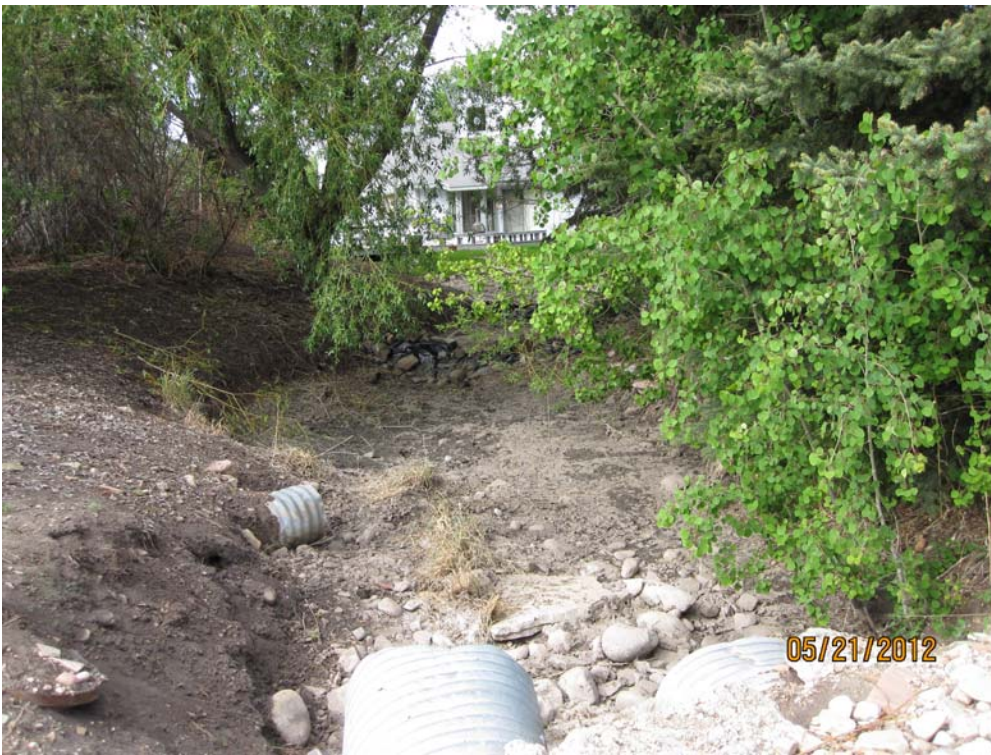
Photo 1 — Parcel Q north of Silver Springs Road. 2010 Parcel Q stream in winter Dried up. Park is on the left. Lot 37 SSSF is on the right.