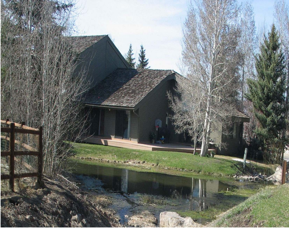
Photo 3a- 2010- 2011 Private pond and stream before the little lake gate repair.