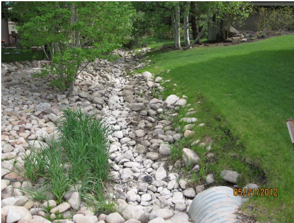
Photo 2 --North most section of Parcel V aka Creek Easement Parcel between Lots 36 and 173 South of Silver Springs Road has dried up.